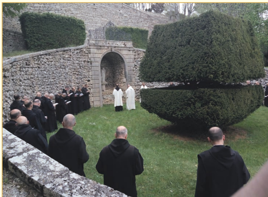
Ex voto to Saint Joseph