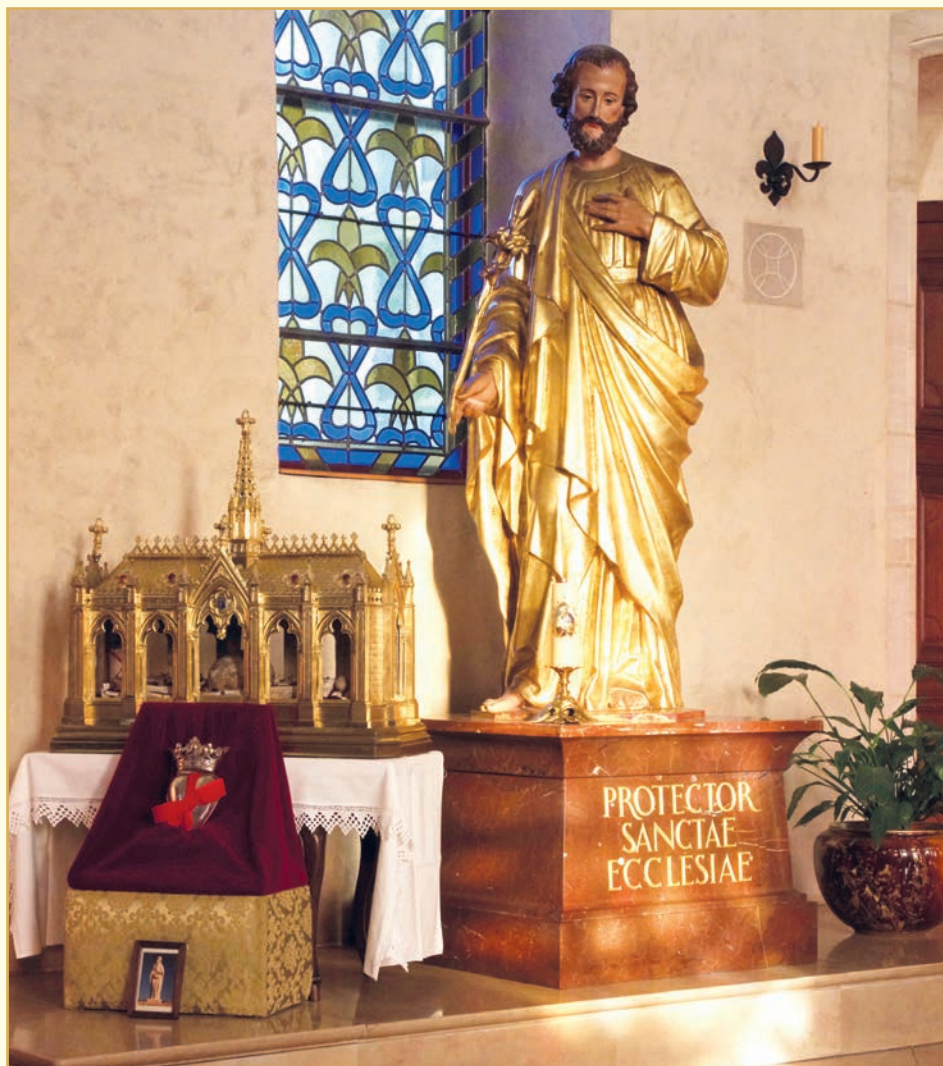
The relics of Saint Reine

The Maison Sainte-Reine has been restored in order to welcome our families and friends of the abbey. Being in fact made up of two separate dwellings connected by a passage, it was split to allow for the accommodation of an extra family in the new “Maison Sainte-Chantal”.