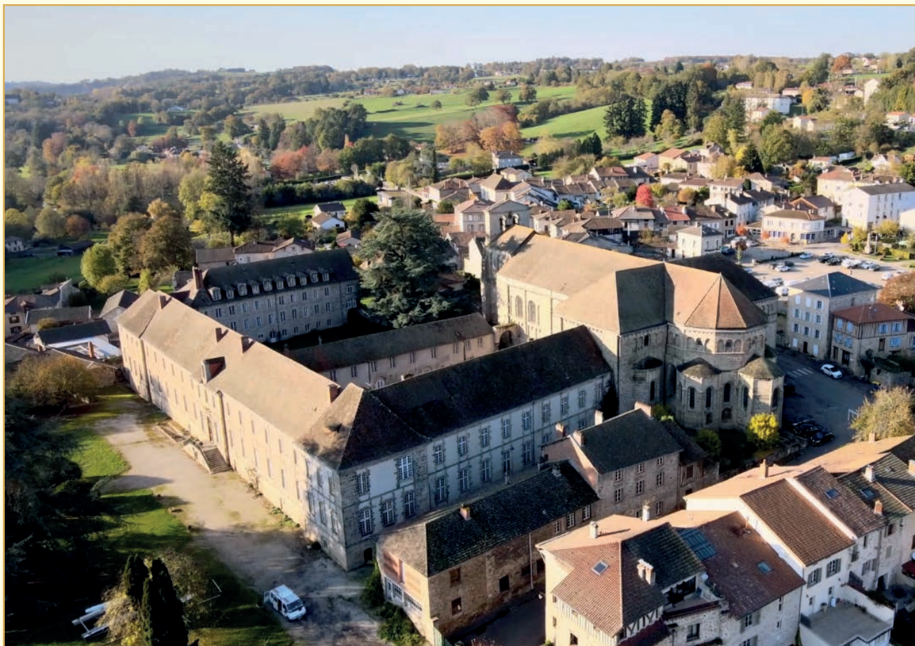
The abbey buildings of Solignac

The main difficulty arises from the fact that the abbey church has become a parish church and is therefore the property of the municipality of Solignac. This raises a problem of coexistence. The Romanesque church is a classified “historical monument”, which places any important alterations under state supervision. The acquisition of land adjoining the abbey’s domain will also require careful consideration.